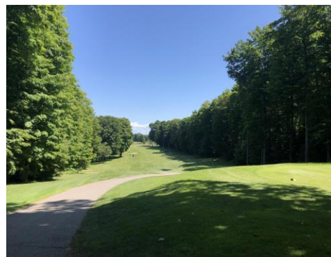
Chestnut Valley Golf Course over the summer, during our family round of golf.