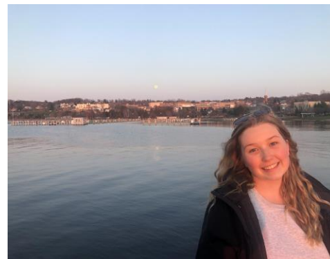
Me on the Pier in downtown Petoskey, watching the sunset during May.