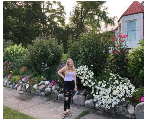
Me in Harbor Springs, posing next to the pretty landscaping during the spring.